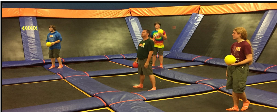
Left Picture: YH Chapter enjoying their meeting at SkyZone, a trampoline park.